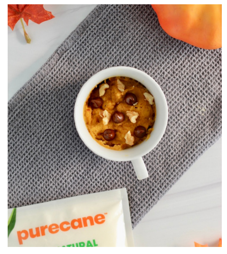
Blog Post + Social Partnership with Purecane Sweeteners

Instagram Reel Partnership with Bristol of Maine Seafood