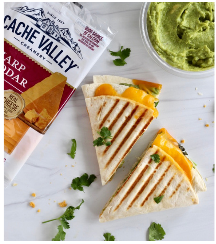
Instagram Partnership with Cache Valley Creamery